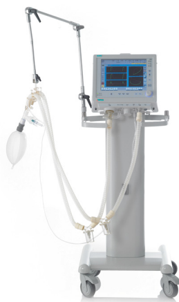
Ventilator workstation on optional mobile trolley.

Customizable alarm system allows deactivation of nuisance alarm.