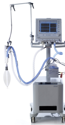
Ventilator workstation with optional medical air compressor.